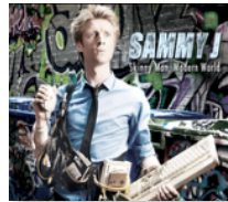
Skinny Man, Modern World CD, Words & Music Entertainment (2012)