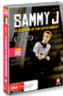
58 Kilograms of Pure Entertainment DVD, Madman Entertainment (2011)